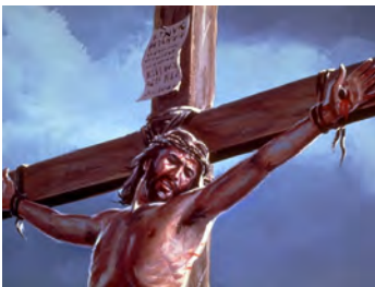
Everyone becomes part of the family through the blood of Christ.

Christ is the Mediator of the New Testament (covenant) by means of His sacrifice. The forgiveness of sins through His blood made it possible for us to enter into a saving relationship with Him. Through the cross we became part of His family.