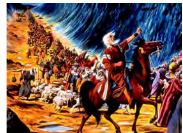
God's chosen people.

The children of Israel who came out of Egypt were God's chosen people. They received the oracles of God; to them the promises were made when God entered into a covenant relationship with them. But God planned that His people should enter into a better covenant relationship with Him. The basis of the new covenant was not written on tables of stone (the 10 commandments), but the same law was written on the heart. The old covenant was given to literal Israel, but the new covenant to spiritual Israel. Even before the cross men were saved by virtue of the promises of the New Covenant that were ratified by the blood of Christ at Calvary. God's true people – spiritual Israelites – were always those who loved God enough to obey Him. His law was written in their hearts. Their religion was not an outward show, but an inward experience by the power of God, which manifested itself in righteous living.