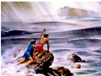
The flood caused the creation of many fossils by burying objects quickly under layers of sediment.

The Bible records show that man has been on this earth for about 6,000 years. This is a far cry from the multi millions of years taught by modern man. The evidence used to determine the age of the earth is found in buried fossils. The remains of different creatures are found in the various rock strata of the earth's surface. The simpler forms of life are usually found in the lower strata, and more complex life is