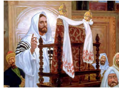
Jesus taught and believed in creation.

And He answered and said to them, “Have you not read that He who made them at the beginning ‘made them male and female,’ and said, ‘For this reason a man shall leave his father and mother and be joined to his wife, and the two shall become one flesh’? So then, they are no longer two but one flesh. Therefore what God has joined together, let not man separate.”