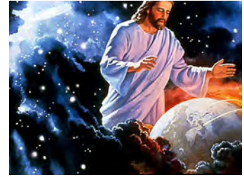
We are made by design, not by chance.

which would also be miraculous. The chances of such an occurrence: to create single cell life – the lowest form of life – would be 1 in a number too great to write down. Then to think how man is so complex in his structure – not just single cell life – the thought of life just happening, is absurd. The Psalmist said, We are “fearfully and wonderfully made”. Psalm 139:14. Only a Creator could have designed the intricate body of man. Each part of the body works in co-operation with every other part – not by adaptation, but by design. Surely it would take more faith to believe in evolution than creation.