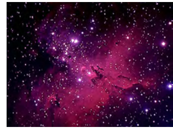
The heavens declare God's glory.

Psalm 33:6,9 By the word of the LORD the heavens were made, and all the host of them by the breath of His mouth. For He spoke, and it was done ; He commanded, and it stood fast.