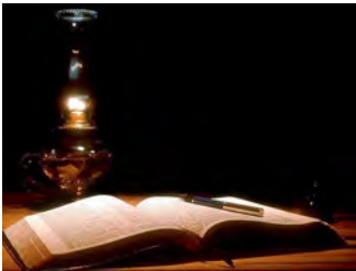
Will we trust God’s word or man’s theory?

The theory of evolution is an effort to get rid of God. The hypothesis of natural evolution places God in obscurity – in fact makes Him unnecessary. It also degrades man to the lowest forms of life and makes him a descendant of the brute, instead of a creature formed in the image of God. If it were true that man has ascended from the brute creation, there should be evidence of it everywhere. All about us would be signs of life in transition from one stage to another. This transition is found nowhere.