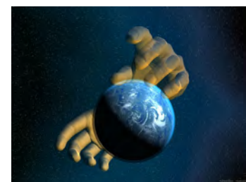
In the beginning God created the heavens and the earth.

Where does the evolutionist begin? Having discarded the Bible record, it is not easy for him, for he must rely on presumption and speculation. The evolutionists theory, (it is only a theory, for evolution cannot be proved) speculates that life began in the remote ages of the past when matter and force existed together, and by chance, life began. It is worth questioning where the force and matter came from. Who made the matter? Who released the force in the universe? Without God, the finite mind finds no satisfactory explanation of life and nature.