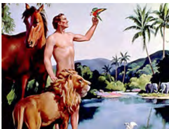
God created the family groups for every creature – you can’t cross-breed across groups (eg cross a bird with a dog).

Genesis 1:21,24,25 So God created great sea creatures, and every living thing that moves, with which the waters abounded, ACCORDING TO THEIR KIND, and every winged bird ACCORDING TO ITS KIND. And God saw that it was good. Then God said, “Let the earth bring forth the living creature ACCORDING TO ITS KIND: cattle, and creeping thing, and beast of the earth each ACCORDING TO ITS KIND”; and it was so. And God made the beast of the earth ACCORDING TO ITS KIND, cattle ACCORDING TO ITS KIND, and every thing that creeps on the earth ACCORDING TO ITS KIND. And God saw that it was good.