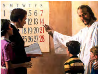
The Sabbath reminds us the world was made in six days.

Thus the heavens and the earth, and all the host of them, were finished. And on the seventh day God ended His work which He had done, and He rested on the seventh day from all His work which He had done. Then God blessed the seventh day and sanctified it, because in it He rested from all His work which God had created and made.