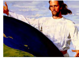
God is all powerful and the source of all life.

God is still able to create. He created life in the beginning and today He can make us anew if we come to Him. He will give us a clean heart. When we come to the cross of Jesus Christ we will be “born again”.