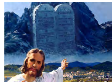
The new covenant writes God's law on our hearts.

The Old Covenant was an agreement God made with Israel to demonstrate to them their weakness and their entire dependence upon Christ for power to keep God's law. They promised to obey, and meant it, but discovered that