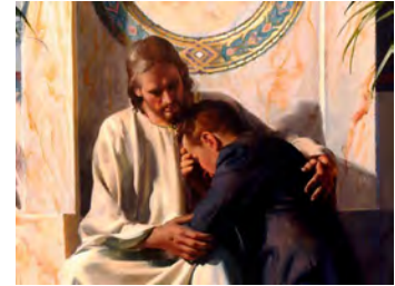
I can do all things through Christ.

2 Corinthians 3:3 Clearly you are an epistle of Christ, ministered by us, written not with ink but by the Spirit of the living God, NOT ON TABLETS OF STONE BUT ON TABLETS OF FLESH, THAT IS , OF THE HEART.