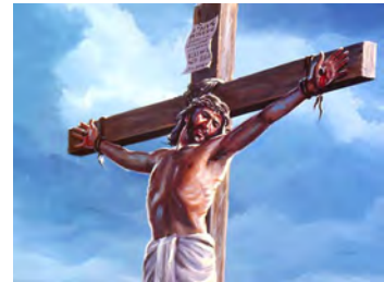
The New Covenant had always existed, both before and after the cross.

The New Covenant and the Everlasting Covenant are the same. No person living in Old Testament times was saved by virtue of the Old Covenant. His salvation was dependent upon the New Covenant which was really in effect before the foundation of the world. “The Lamb slain from the foundation of the world”. Rev 13:8.