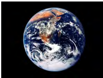
The power to live the Christian life comes from God, not us. It is the same power that made the world.

Those who are under the Everlasting Covenant will receive the promises. Their sins are forgiven, their prayers are heard, they have Christ's righteousness, they will be raised to life eternal, they will live in the Promised Land – Paradise, and Christ will dwell with them forever. The covenant of promise was given to Adam and Eve, to Abraham and to the children of Israel as it was taught through the sacrificial services. All men and women throughout history find salvation only by the New or Everlasting Covenant. Only Christ's blood can atone for sin.