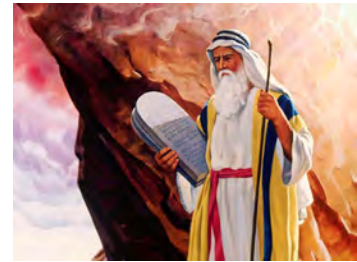
Ten Commandments written on stone.

“ ‘Now therefore, IF YOU WILL INDEED OBEY MY VOICE AND KEEP MY COVENANT , then you shall be a special treasure to Me above all people; for all the earth is Mine. And you shall be to Me a kingdom of priests and a holy nation.’ These are the words which you shall speak to the children of Israel.” So Moses came and called for the elders of the people, and laid before them all these words which the LORD commanded him. Then all the people answered together and said, “ ALL THAT THE LORD HAS SPOKEN WE WILL DO. ” So Moses brought back the words of the people to the LORD.