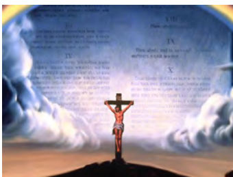
Grace gives us righteousness to keep the law because we can't without it.

Some believe that the Old Covenant was the moral law, or the Ten Commandments, and that when the new covenant was ratified, the law was annulled or set aside. But the Old Covenant was not the 10 commandment law. Instead, it was an agreement made between God and the people. True, the commandments were the basis of the covenant but they were not the covenant. The law was only the subject.