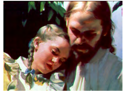
God loves us dearly but we must take Him seriously that He knows best.

Why is God so particular? He wants us to prepare for eternal life, and He knows that if we follow our own way we will be lost. The only way to the kingdom is on the narrow and difficult way. Jesus is the door to this path, made possible through Calvary. While ever we trust in Him, and do His will, we are safe and we will gain eternal life at last. God is particular. Let us determine to be particular and never deviate from the path of righteousness.