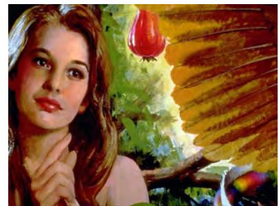
When Eve took the fruit, it was her death sentence!

Even though Eve was deceived, she was nevertheless guilty. Her act was inexcusable, for she had chosen to believe Satan speaking through the serpent, rather than God. Adam’s sin was perhaps worse, because of the fact that he was not deceived, yet he deliberately chose disobedience to the command of God. He was prepared to share his wife’s fate because of his deep love for her. Little did the first pair realize to what devastating results their disobedience would lead.