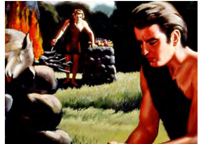
Cain and Abel offering their sacrifices.

Cain was trying to buy God's favour by good works, but forgiveness is only possible through the blood.