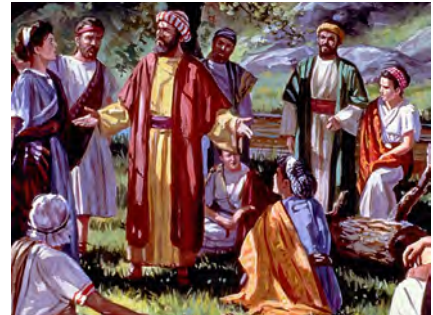
Ananias and Sapphira lied to the Holy Spirit and paid with their lives.

But a certain man named Ananias, with Sapphira his wife, sold a possession. And he kept back part of the proceeds, his wife also being aware of it , and brought a certain part and laid it at the apostles' feet. But Peter said, “Ananias, why has Satan filled your heart to LIE TO THE HOLY SPIRIT AND KEEP BACK PART OF THE PRICE OF THE LAND FOR YOURSELF? While it remained, was it not your own? And after it was sold, was it not in your own control? Why have you conceived this thing in your heart? You have not lied to men but to God.” THEN ANANIAS, HEARING THESE WORDS, FELL DOWN AND BREATHED HIS LAST. So great fear came upon all those who heard these things.