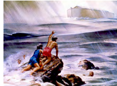
Those who rejected God by refusing to enter the ark, perished in the flood.

There are some who trample underfoot God’s holy Sabbath day. “It doesn’t matter which day you keep, as long as you keep one day in seven” they say. What does the commandment say? “Remember the Sabbath day to keep it holy”. God has commanded that we remember the Sabbath and not any other day. He further says, “The seventh day is the Sabbath.” No other day is said to be the Sabbath. Will we obey or not? Will we say that it doesn’t matter? Is God particular or not? Disobedience to this command, to those who are enlightened, will ultimately result in the same fate as Adam and Eve, the people who did not go into Noah’s ark, or Uzzah.