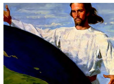
God is love.

1 Corinthians 13:4,5 LOVE suffers long and is kind; LOVE does not envy; LOVE does not parade itself, is not puffed up; does not behave rudely, DOES NOT SEEK ITS OWN, is not provoked, thinks no evil.