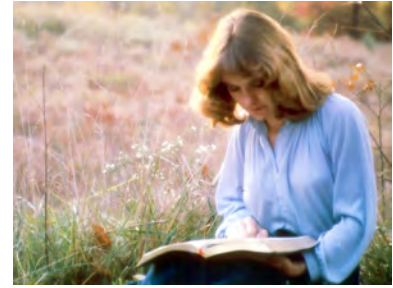
To pray and study God's Word alone and together will keep you strong in marriage.

1 Corinthians 7:3-5 Let the husband render to his wife the affection due her, and likewise also the wife to her husband. The wife does not have authority over her own body, but the husband does . And likewise the husband does not have authority over his own body, but the wife does . DO NOT DEPRIVE ONE ANOTHER EXCEPT WITH CONSENT for a time, that you may give yourselves to fasting and prayer; and come together again so that Satan does not tempt you because of your lack of self-control.