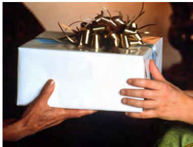
Love unexpressed dies – speak and show your love.

One vital factor in marriage is to express love. If a husband loves his wife he should tell her. He can commend her for her cooking (if he can do so with a clear conscience), her housework, and her dress. If he praises her (not flatters) she will bloom. The wife can express her love to her husband in kind loving words. But remember LOVE UNEXPRESSED DIES .