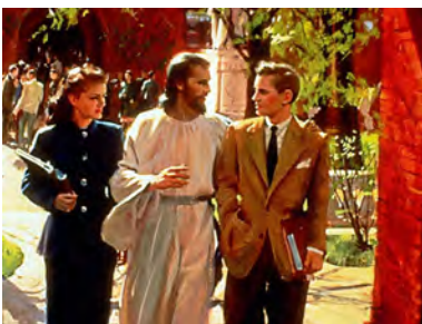
A couple united in Christ lays the strongest foundation.

Genesis 27:46; 28:1 And Rebekah said to Isaac, “I am weary of my life because of the daughters of Heth; if Jacob takes a wife of the daughters of Heth, like these who are the daughters of the land, what good will my life be to me?” Then Isaac called Jacob and blessed him, and charged him, and said to him: “YOU SHALL NOT TAKE A WIFE FROM THE DAUGHTERS OF CANAAN.”