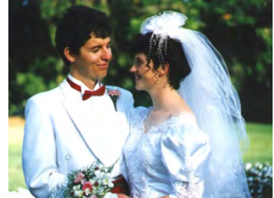
Marriage is for life.

The Pharisees also came to Him, testing Him, and saying to Him, “Is it lawful for a man to divorce his wife for just any reason?” And He answered and said to them, “Have you not read that He who made them at the beginning ‘made them male and female,’ and said, ‘For this reason a man shall leave his father and mother and be joined to his wife, and the two shall become one flesh’? So then, they are no longer two but one flesh. Therefore what God has joined together, let not man separate.” They said to Him, “Why then did Moses command to give a certificate of divorce, and to put her away?” He said to them, “Moses, because of the hardness of your hearts, permitted you to divorce your wives, but from the beginning it was not so. And I say to you, WHOEVER DIVORCES HIS WIFE, EXCEPT FOR SEXUAL IMMORALITY, AND MARRIES ANOTHER, COMMITS ADULTERY; and whoever marries her who is divorced commits adultery.”