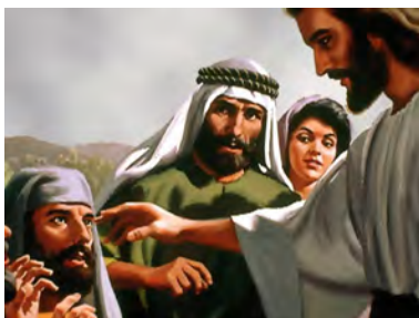
We should serve one another as Jesus serves us.

True marriage will bring the closest of relationships. The home of a happy Christian couple can be a haven for them in this world. Marriage can indeed be one of the greatest adventures in life.