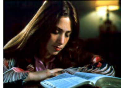
The value of a woman who loves God is above rubies.

Proverbs 31:30 Charm is deceitful and BEAUTY IS PASSING, but a woman who fears the LORD, she shall be praised.