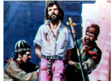
As in the Dark Ages, this persecuting power will persecute God's people again.

Daniel 8:23-25 And in the latter time of their kingdom, when the transgressors have reached their fullness, A KING SHALL ARISE, HAVING FIERCE FEATURES, WHO UNDERSTANDS SINISTER SCHEMES. HIS POWER SHALL BE MIGHTY , but not by his own power; he shall destroy fearfully, and shall prosper and thrive; HE SHALL DESTROY THE MIGHTY, AND ALSO THE HOLY PEOPLE . Through his cunning he shall cause deceit to prosper under his rule; and he shall exalt himself in his heart. He shall destroy many in their prosperity. HE SHALL EVEN RISE AGAINST THE PRINCE OF PRINCES ; but he shall be broken without human means.