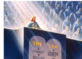
Little Horn Power exposed and condemned in the heavenly Judgment that began in 1844.

For more detail on the 2300 days, see the study on the 2300-day prophecy and the judgment . It is no wonder the heavenly watchers were alarmed and anxiously asked, “How long will the vision be ?” No wonder it seemed to be too much for Daniel and he “fainted and was sick for days.” The dominance of this antichrist power and the persecution of God’s people were almost too much to bear. The meaning of this prophecy was not understood in this chapter. The final verse says clearly that none understood the vision. Daniel understood all features of the vision explained to him, except the 2300 days. Daniel 9 reveals the meaning of the first 70 weeks of the 2300 days. Daniel 8:14 tells us what happens at the close of the 2300 days – the sanctuary would be “cleansed” or “justified” (margin) indicating judgment. This was the beginning of a worldwide movement proclaiming God’s judgment hour message, and the beginning of the investigative judgment in heaven.