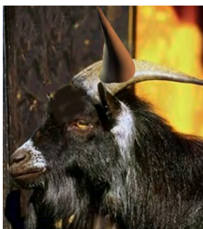
A little horn arose out of one of the four horns.

Some have mistaken the little horn to be Antiochus Epiphanes, king of Syria who was a great enemy and persecutor of the Jews. But as we will see, it cannot be so, because he does not fit into the details of the prophecy.