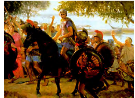
Large horn on Goat symbolized Alexander the Great.

Here is emphasized the sudden fall of Alexander. He was the large horn that was broken. This mighty warrior died at the age of thirty-three, partly because of his overexertions in conquering the world, and partly from a fever caused by his intemperate living. After a drunken debauch he was seized with a violent fever and died eleven days later, June 13, 323 B.C. Before he died he was asked who should rule the kingdom. His reply was “let it go to the strongest!” Alexander’s brother and two infant sons were declared rulers of the empire, but they were soon murdered and the family of Alexander became extinct. Thus there were twenty years of strife between the generals of Alexander as they struggled for the supremacy. Ultimately the empire was divided into four kingdoms, paralleling the four notable horns. Macedonia was ruled by Cassander, Thrace and Asia Minor by Lysimachus, Syria by Seleucus and Egypt by Ptolemy.