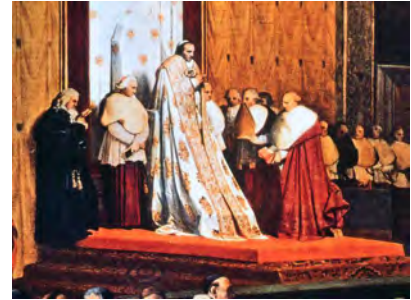
The Papacy is the Little Horn of Daniel Eight.

Rome and Rome only fits this historical picture. Without doubt it is the “little horn” of Daniel 8.